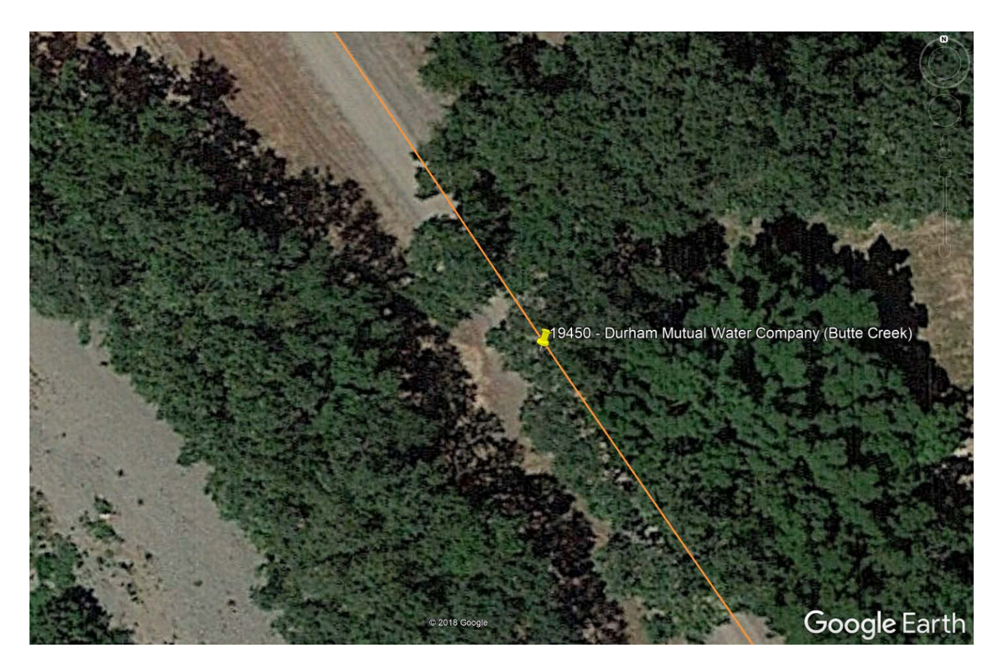
Attachment 2. Site location map